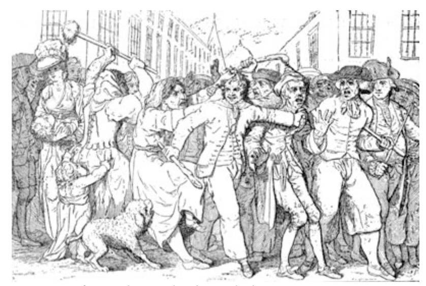
A fun night Southside, with the Press Gang.....

S o at last we come to a very limp week four not even a trip to the clubs this week! Lt Huckerback, Lt Templeton-Smythe and Captain Steel all practise their weapons all week long, very boring!!