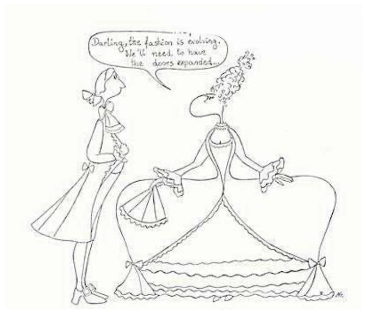
"Darling the fashion is evolving. We need to have the doors expanded!"

So lets have a butchers at week three....ah this looks better some sort of do ....or is it?